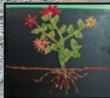
ART BY SIVA ADITYAN S ID